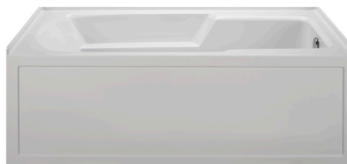
Front view of the integral skirt.